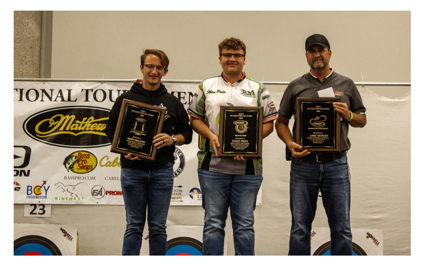
2023 On Target for Life Award Winners