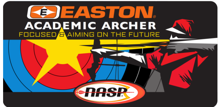
AA Decal and Patch