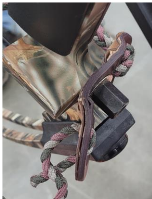
This style bolt is permitted.